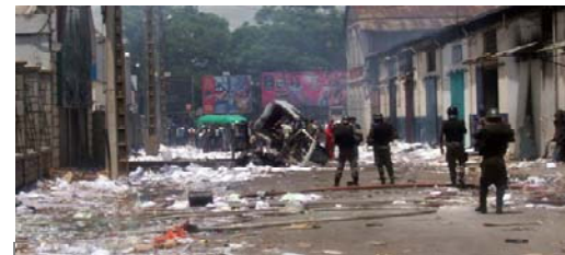
Madagascar March 2009

With trouble brewing, traveler evacuation is initiated 4 days ahead of the U.S. government's warning.